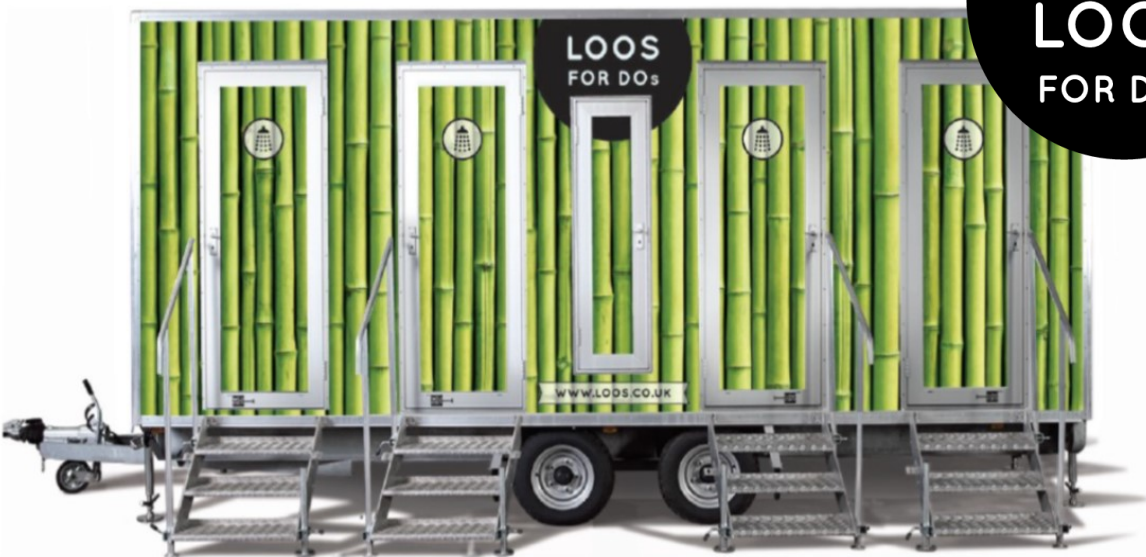
L—19.8ft/6.0m * dimensions include allowance for tow hitch